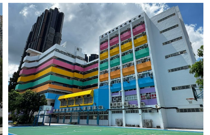
T.W.G.Hs. Sin Chu Wan Primary School