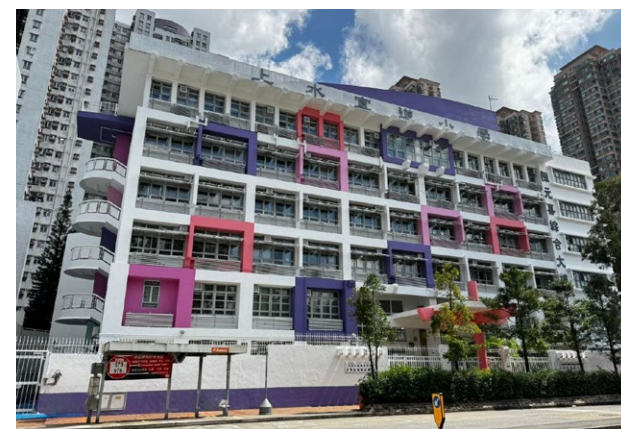
Alliance Primary School, Sheung Shui