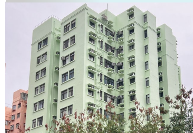
Fook Chi Building