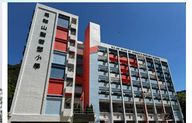
Ma On Shan St. Joseph's Primary School